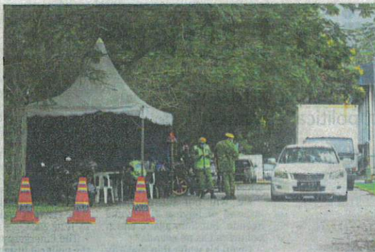
On high alert: Rela officers at a roadblock near the school in Seremban.

AKHBAR : THE STAR MUKA SURAT : 5 RUANGAN : NATION