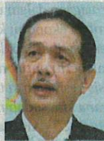
DR NOOR HISHAM

Selain itu, dua kes direkodkan masing-masing di Terengganu dan Sarawak serta satu kes