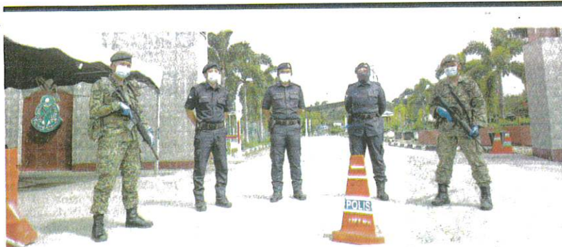
ANGGOTA polis, tentera melakukan kawalan ketat di hadapan Penjara Pokok Sena, Kedah.

Sementara itu, beliau berkata, bagi satu kes import yang dilaporkan semalam, ia melibatkan warga asing yang memasuki negara dari Nepal.