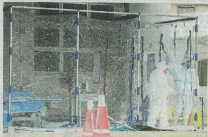
A mobile isolation negative pressure chamber installed by Osimal Foundation at Likas Hospital in Kota Kinabalu.

"The resolve and sacrifices of frontline health workers must be matched by every individual and