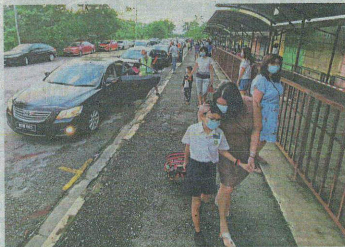
Trying times: A file photo of parents dropping off students at a school in Kuala Lumpur. While some believe schools must go on, some parents want more measures to be taken first.

"At the end of the day, it boils down to parents' and teachers' mindset and ingenuity to