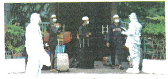
BEBERAPA kakitangan kesihatan tiba di STIAS Senawang bagi membawa pelajar yang positif Covid-19 ke Hospital Rembau.

Sementara itu, katanya, segala keperluan asas termasuk bekalan makanan, pelitup muka dan pencuci tangan adalah mencukupi hasil sumbangan pihak Yayasan Sofa dan Kumpulan Pendidikan Muhammadiyah selain bantuan ibu bapa dan orang ramai.