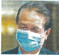
Dr Noor Hisham Abdullah