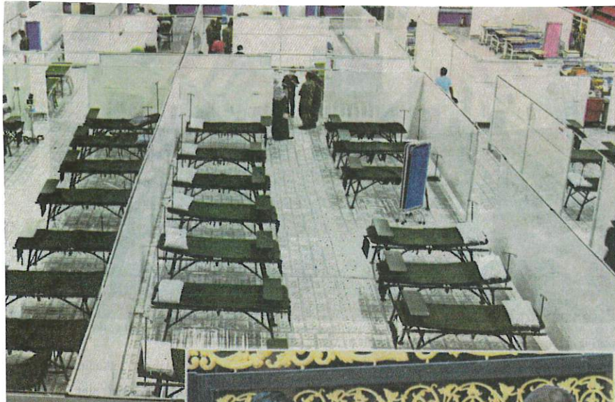
Beds at the makeshift hospital for Covid-19 patients at the Tawau sports complex set up by the armed forces recently. (Inset) Health officials and policemen checking on a person undergoing home quarantine in Sandakan on Monday.