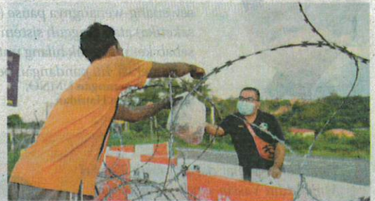
Penduduk Kampung Tajau membeli barang melalui pagar kawat duri yang dipasang bagi menutup laluan di Jalan Serusup, Tuaran. Kampung Tajau antara kawasan yang mencatatkan pertambahan kes positif Covid-19 di Sabah.

Beliau berkata, daripada jumlah itu, Sabah turut mere-