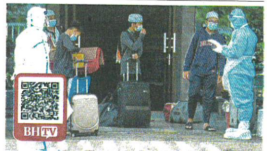
Sebahagian pelajar STIAS yang positif dibawa keluar ke pusat kuarantin.